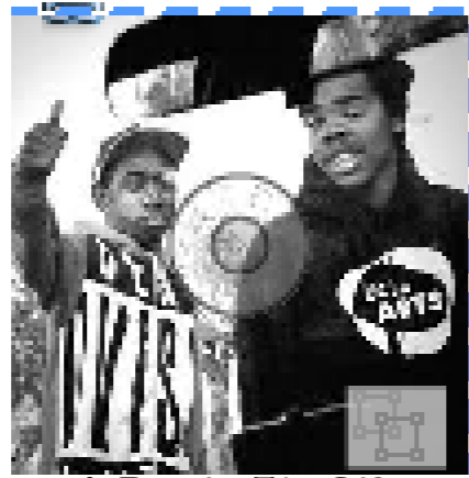
A Day in The Life: Earl Sweatshirt